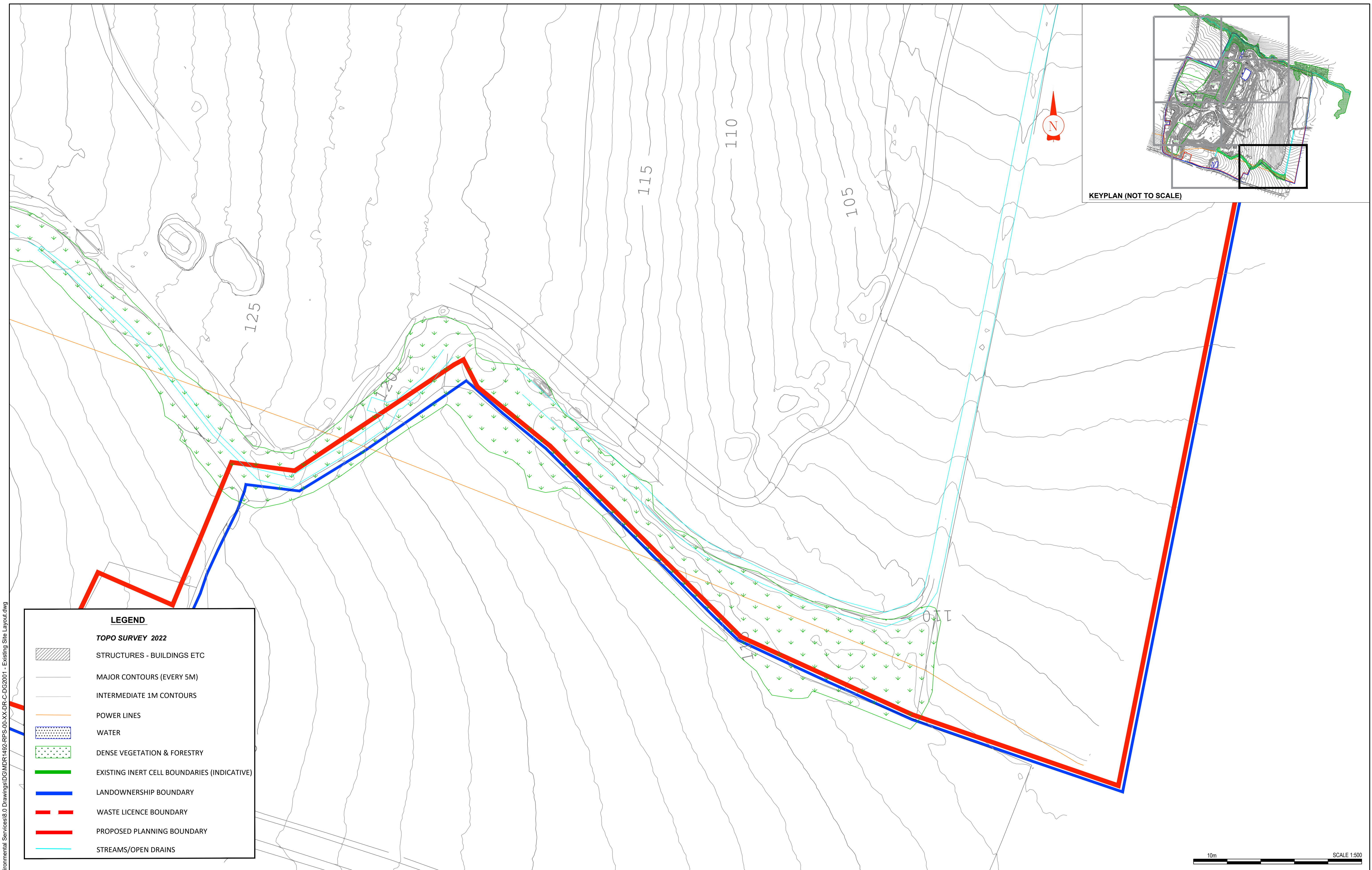
KEYPLAN (NOT TO SCALE)